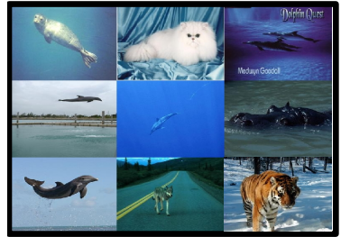
(d) ‘blue’ background