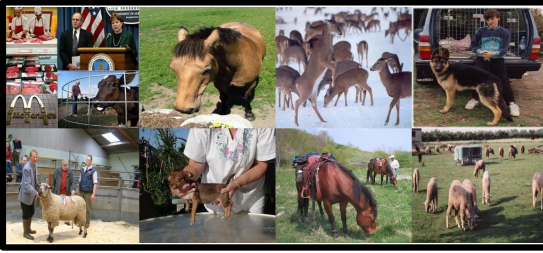
(a) More than one animal or things