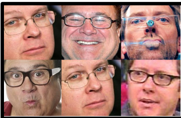
(g) (apparently) wearing spectacles