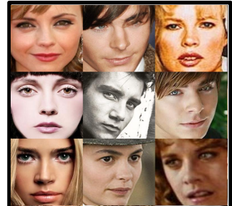
(f) hair falling forward OR covered head