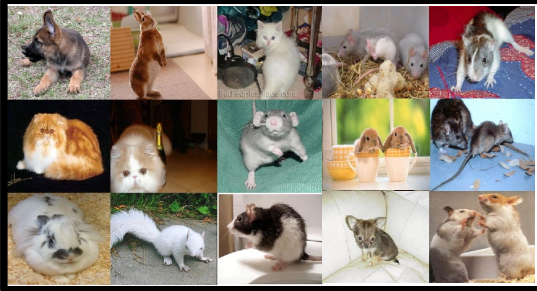
(c) ‘small’ animals