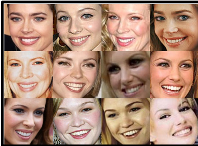
(e) smiling young females