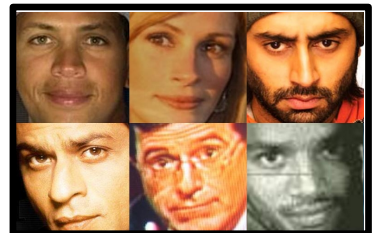
(h) ‘yellowish’ lighting on images