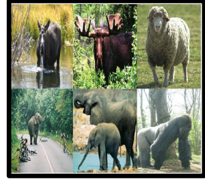
(b) All animals in picture ‘appear’ to be ‘bulbous’